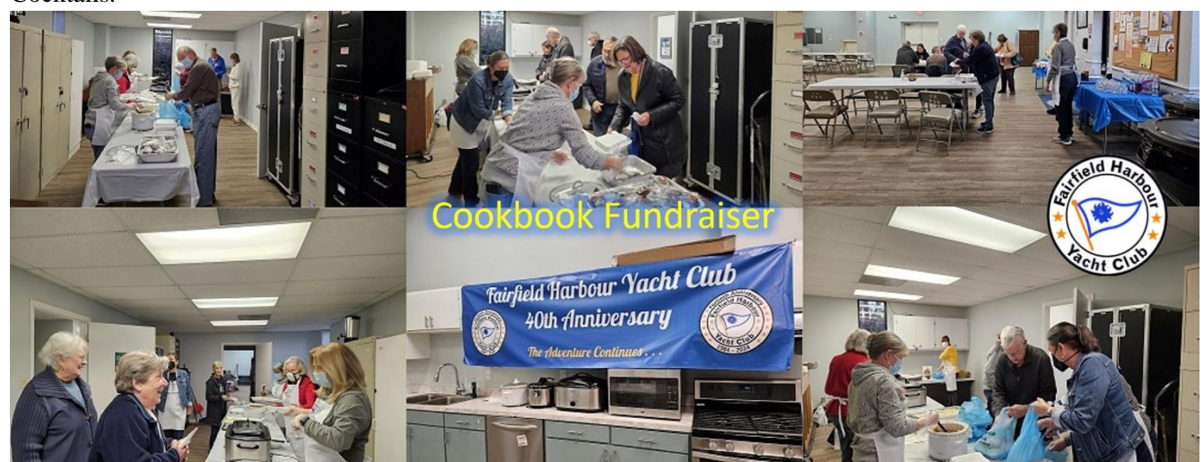
BBQ Dinner Photos

When the committee asked club members for recipes, they were surprised to receive over a hundred, which was narrowed down to 85 for the final printing. Everyone who submitted recipes had at least one published. The cook who submitted the recipe "staged" and photographed a picture of the finished product and wrote a short story about why this was a favorite recipe. Before the book could be sent to the publisher, the recipes had to be formatted all the same, which was a big task. Each committee member was responsible for editing one category and working with the contributor. The mouthwatering categories are Breakfast and Brunch, Appetizers and Hors d'oeuvres, Salads, Soups, and Breads, Entrées, Sauces and Condiments, Sweets and Desserts, and Cocktails.