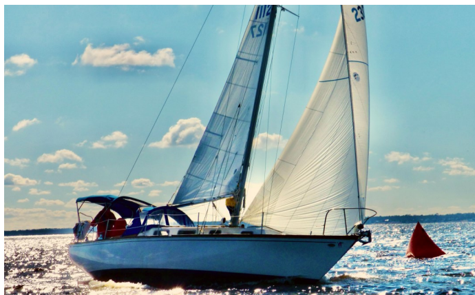
Georgie Girl rounding the racing mark

Many of you have been following my updates on the NYRA 2023-2024 Winter Series that began back in October.