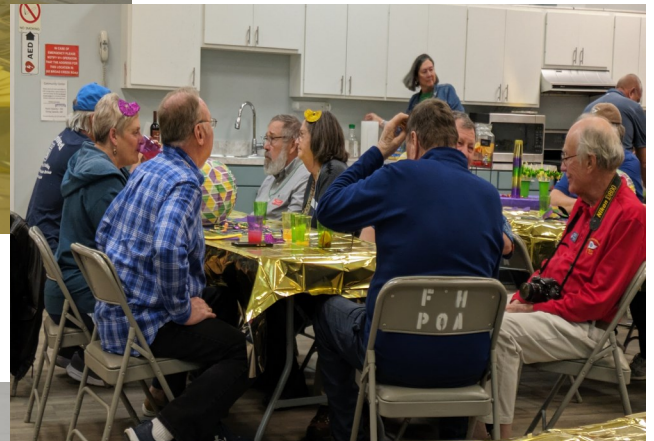
New members and their sponsors enjoying the excellent food.