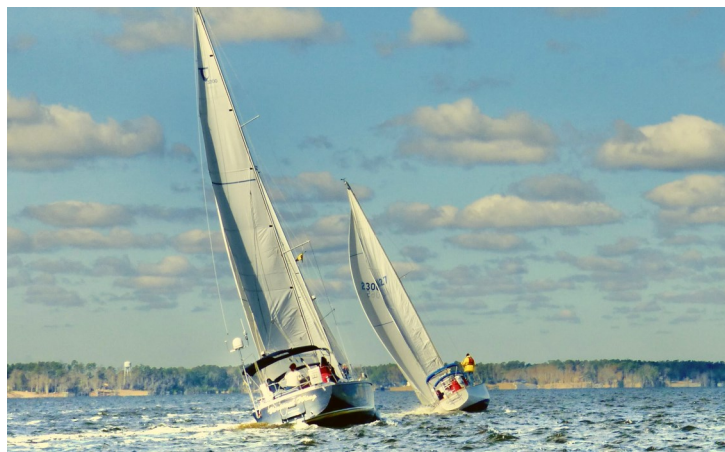
Georgie Girl with Vertical Wing in pursuit