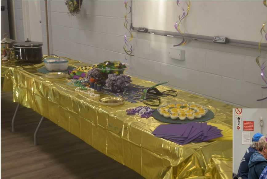
New Orleans style food for the reception

The food was a combination of a Creole dish served over rice, ham sliders, beef sliders, deviled eggs and wings. Of course, to wet our whistles, PC Sam Curry offered Hurricanes. This is a cocktail featuring rum with lemon juice and passion fruit syrup, a very popular drink in New Orleans. Apparently a very popular cocktail here, as well.