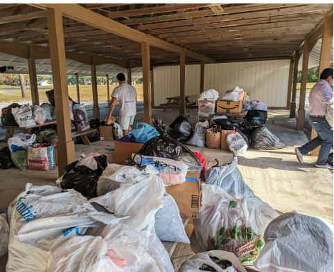
And the clothes just kept coming!