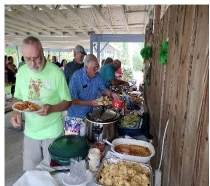
Lots of Good Food