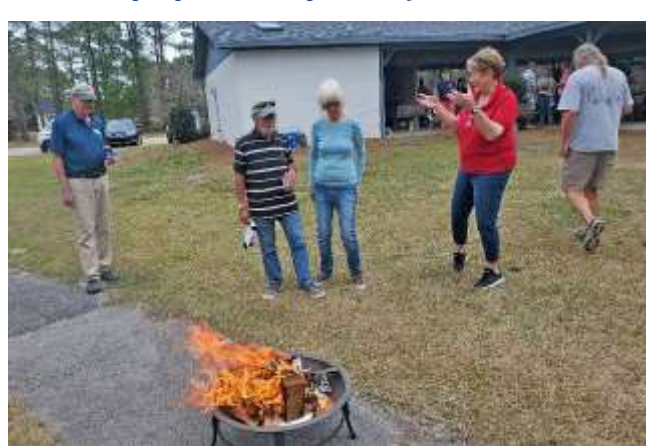
Some people do a happy fire dance