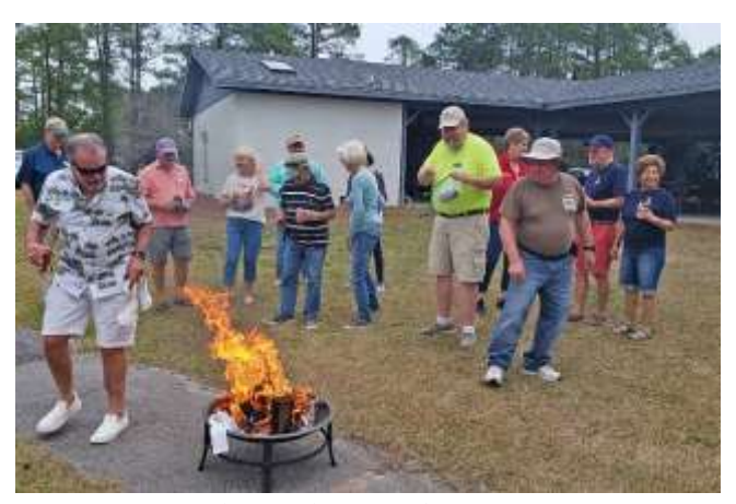
Some people sneak up on the fire

You'll know you're downwind of the Fairfield docks Where they're burning their socks for the Equinox. Original poem by Jefferson Holland, Eastport Adapted by FHYC