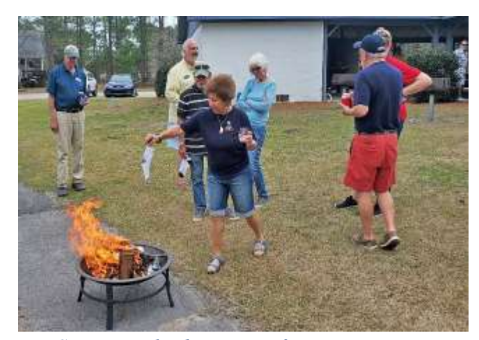
Some people show great finesse