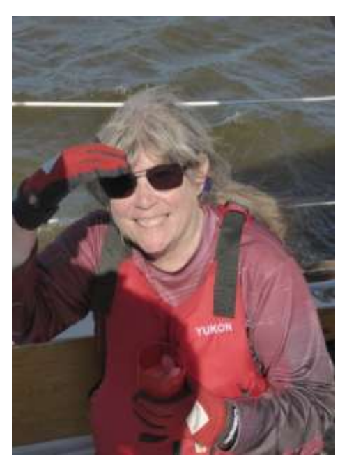
Have you ever seen such a happy sailor?