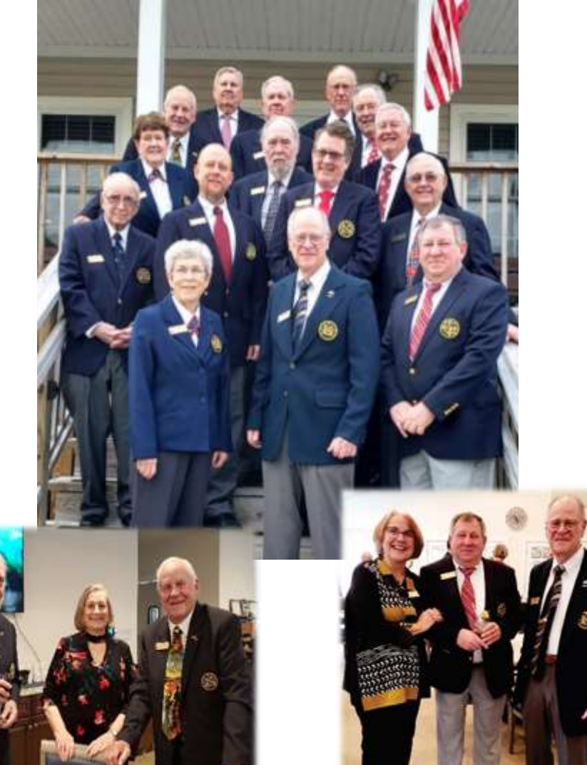
Past Commodores enjoyed a night out at the Harbour Pointe Grille.