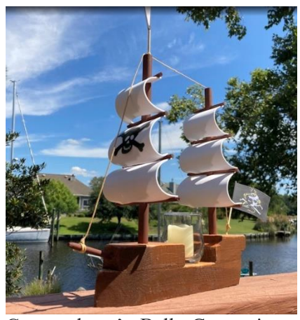
Commodores' Ball Centerpieces made by Craig Myler