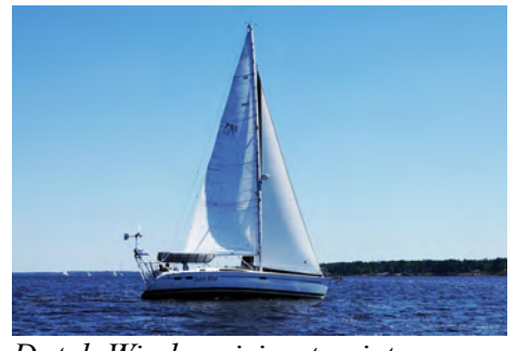
Dutch Wind cruising to victory