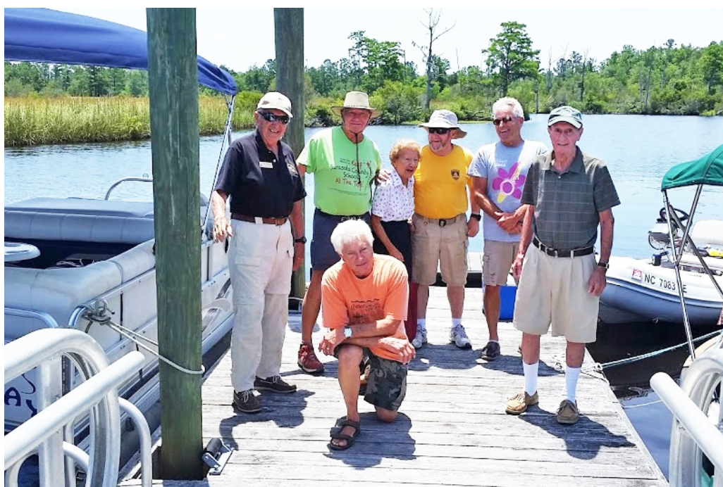
Sailors on the dock at Latham Whitehurst Park Shallow Water Day Cruise June 22