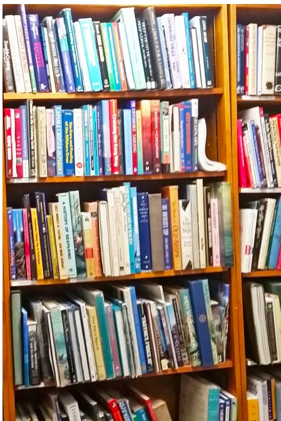
Many new books at the FHYC Library Room 4 of the Activities Center