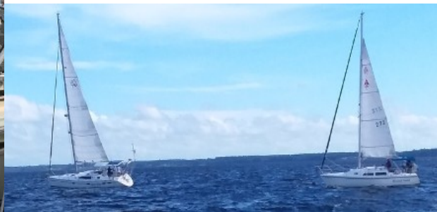
August – Fun Racing (before the start)