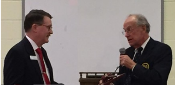
January – Passing the Gavel