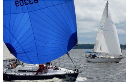
May – Oar Race