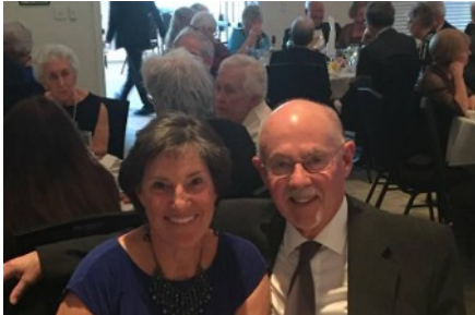
March – Commodores' Ball