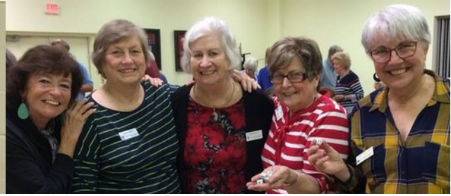
February – Bunco Party