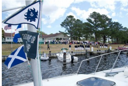
April – Commissioning Day