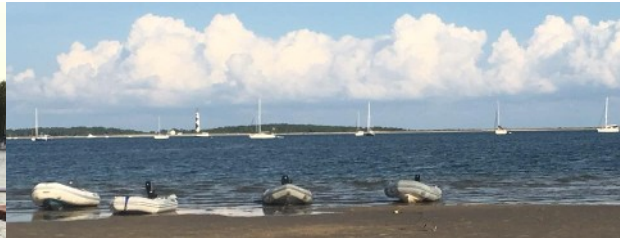
July – Cape Lookout Cruise