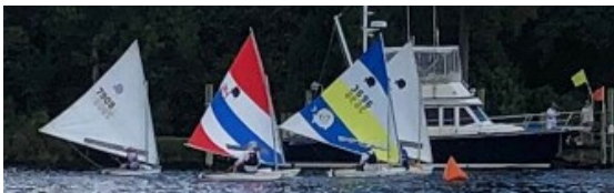
September – Sunfish Racing