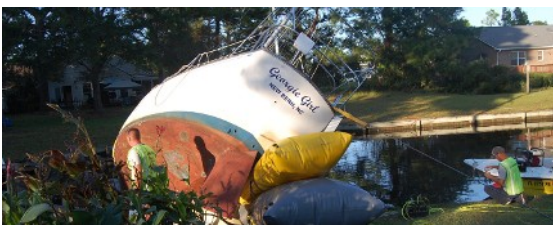
October – Florence Clean-up