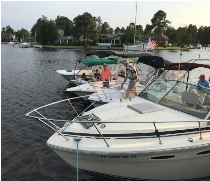
June – Impromptu Raft-up