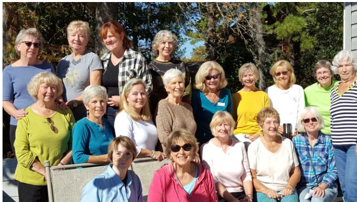
November 3rd Education Event-Ladies Only!

We had a very successful Ladies Only meeting at 5012 Plymouth Ct. here in Fairfield Harbour. A total of eighteen ladies were present. There was a full spectrum of boating knowledge from very experienced to nothing. Everybody enjoyed themselves and there was a call for more similar meetings.