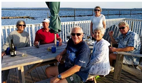
A few of the happy cruisers