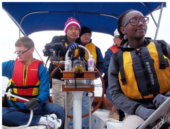
Navy Junior ROTC cadets sailing George Girl