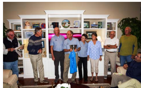
Congrats to Blue Note Crew