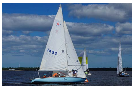
Ensign Fleet 19 Boat of the Year