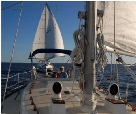
Last Resort overtaking Georgie Girl during a Tuesday Fun Race