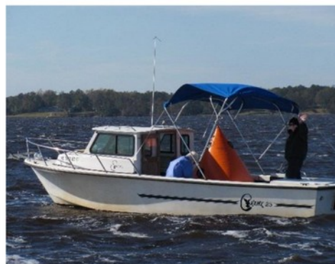
December 2016/January 2017