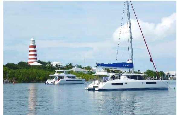
One sail cat and the power cat