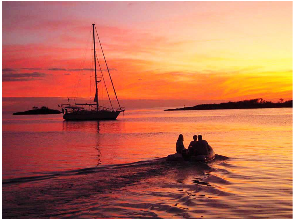
Sea Star Crew at Sunset

Submissions were posted on the Facebook page and members could vote on their favorite. It was a tough choice because some great images were entered. Reviewing the results, it appears the winner only received one more vote than two of the runners up. Submitted by George Stateham, here is the winning photo.