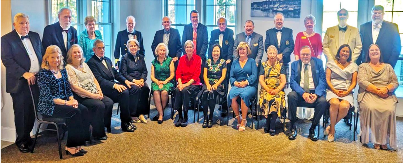
Past Commodores and Commodore attending in order of service from left to right. Escorts Seated.

A crowd of FHYC members enjoyed a night of dining, music, dancing, and fellowship at the annual Commodores' Ball on the evening of Thursday March 21. Held in the Clubhouse at Carolina Colors, this is one of the club's two annual dress up dinners and is always held the third Thursday in March. While it features the current Commodore, it is in recognition of all past Commodores and their contributions to our organization.